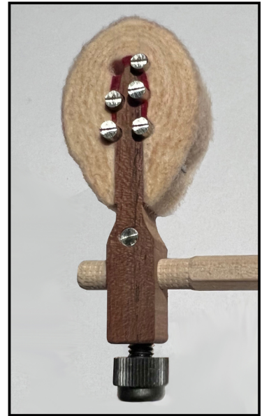
Figure 2: Test hammer with 5 lead-free soft metal inserts for a C4 hammer weight scale #9

Order hammers that are a little heavier than the indicated scale number then bring the weight of each hammer down to specification by carefully reducing width and/or controlling the tapering. Small lengths of soft metal wire calibration weights may also be carefully swaged into the hammer molding for increasing weight if need be. The test hammer in fig. 2 has an example of a swaged calibration weight just above the shank.